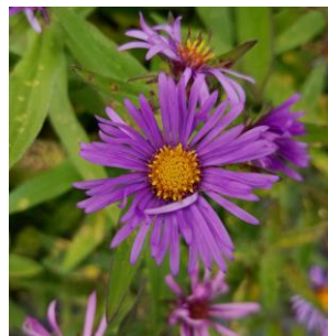
New England Aster